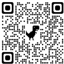
Watch How to Assemble a Split Top