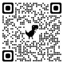
Scan to Visit Denray's Online Document Library